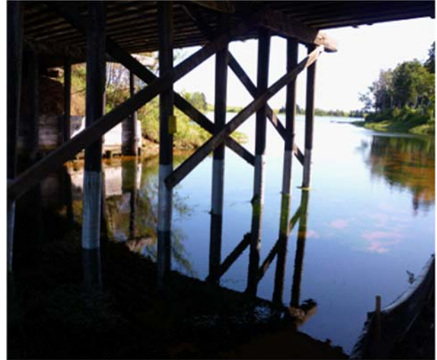
b) Fall 2017 Site Inspection/Observation