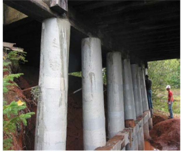
b) PR Jackets after Grouting (Looking South)