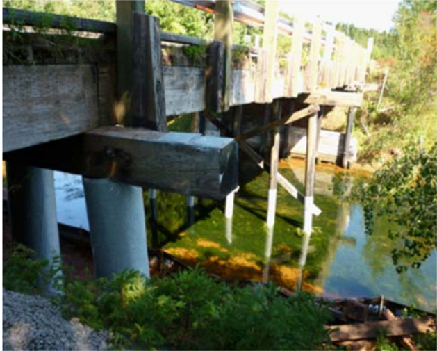
a) Wrapping of Mid-Span Timber Piles