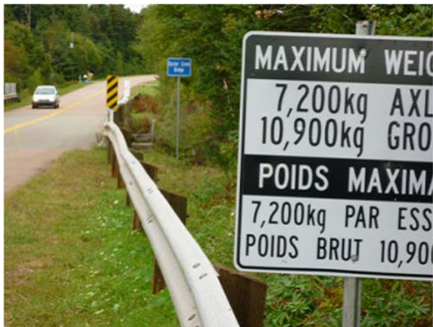
a) Weight Restriction