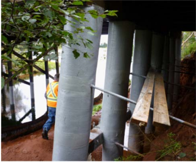
a) PR Jackets after Grouting (Looking North)