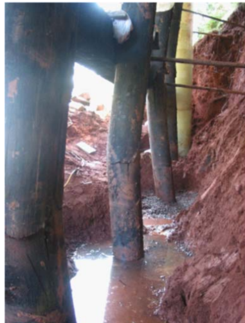
b) Excavation Below Mud Line of the On-Shore Timber Piles