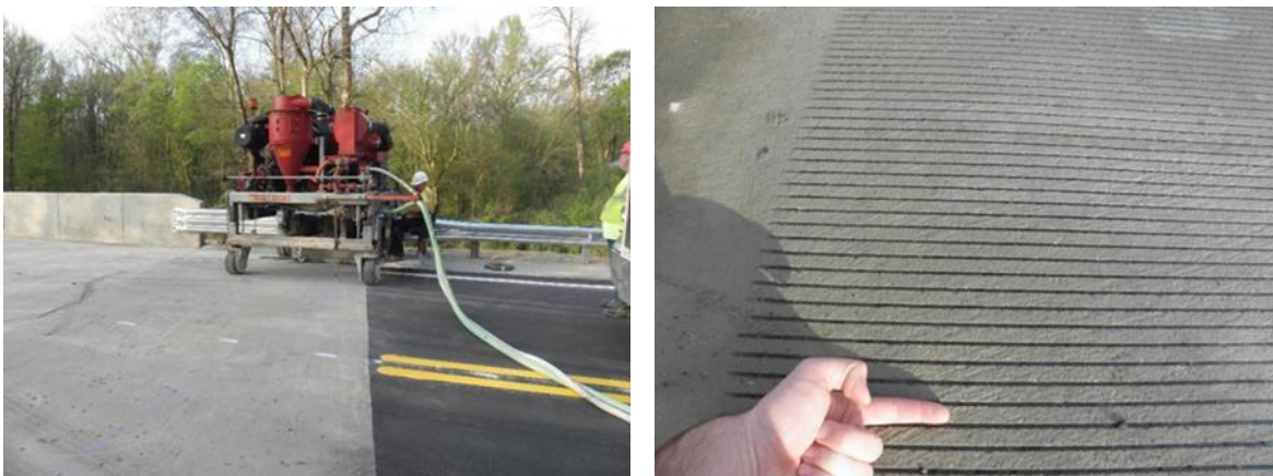
Figure 5: Grooving Machine (left), and Typical Grooved Pavement Section (right)

Diamond grooving of portland cement concrete pavement is a treatment for increasing tire traction and decreasing the possibility of vehicular accidents caused by inclement weather. A study by IGGA showed that after grooving operations have been completed declines in wet pavement vehicular accidents of up to 70% have been reported (IGGA 2013c).