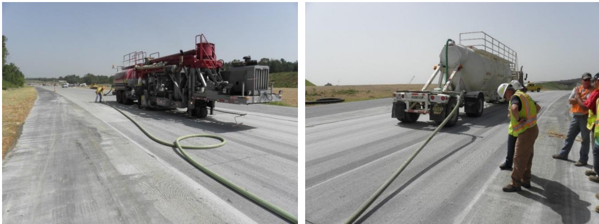
Figure 2: Diamond Grinding Machine (left) and Water Supply Tank (right)

The process of diamond grinding is used to rehabilitate a pavement surface texture to a condition that is often as smooth as a new pavement. Diamond grinding is also used to reduce road noise while increasing surface macro texture and skid-resistance. The process uses closely spaced diamond equipped saw blades attached to a truck bottom and run longitudinally across a pavement surface. The saw requires a constant stream of water, which is provided to the machine by a separate truck run in conjunction with the diamond grinding equipment. A vacuum is attached around the saw blade in a fashion that picks up the water, concrete residuals, and slurry, and sends these materials to a separate holding tank within the water holding truck (Caltrans 2008). The grinding equipment and water truck used can be seen in Figure 2. A picture of the saw blade can be seen in Figure 3 (left) and a typical grinded section can be seen in Figure 3 (right).