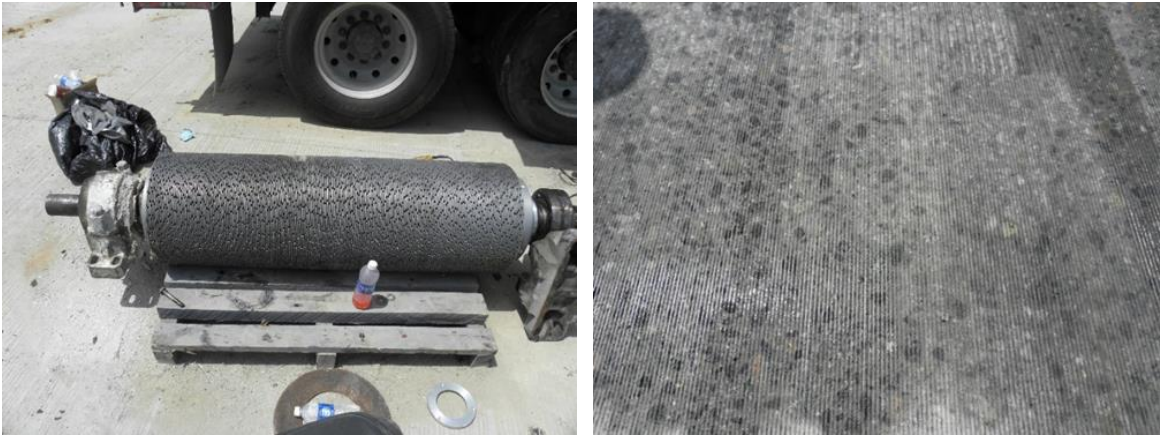
Figure 3: Diamond Grinding Saw (left) and Typical Grinded Section (right)

Additional field and laboratory testing assessing the impact of land application of diamond grinding slurry was performed for NCDOT by Line (2016), with application of diamond grinding slurry and HRW to the field application areas not presenting “significant concern to the soil or vegetation of the application area or adjacent surface waters.”