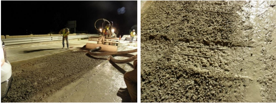
Figure 1: Hydrodemolition Equipment (left) and Post-Hydrodemolition Surface (right)

because it can be controlled in a manner that will demolish sound and unsound concrete to a desired depth, while also creating an appropriately roughened bonding surface for new concrete (Nasvik 2001). The residuals produced during hydrodemolition can be seen in Figure 1 (right).